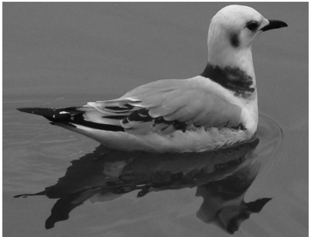
Black-legged Kittiwake in the Southampton harbour in late November - a potential new species for one of our area counts.

** Participants for the Saugeen Shores CBC will meet at the Harvest Moon Café at 7:30 a.m. and the post-count dinner and tally will be held at MacGregor Point Provincial Park at 5 pm