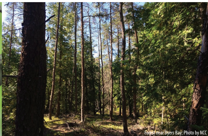
Forest near Dyers Bay