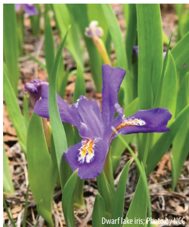
Dwarf lake iris