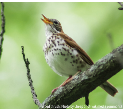
Wood thrush