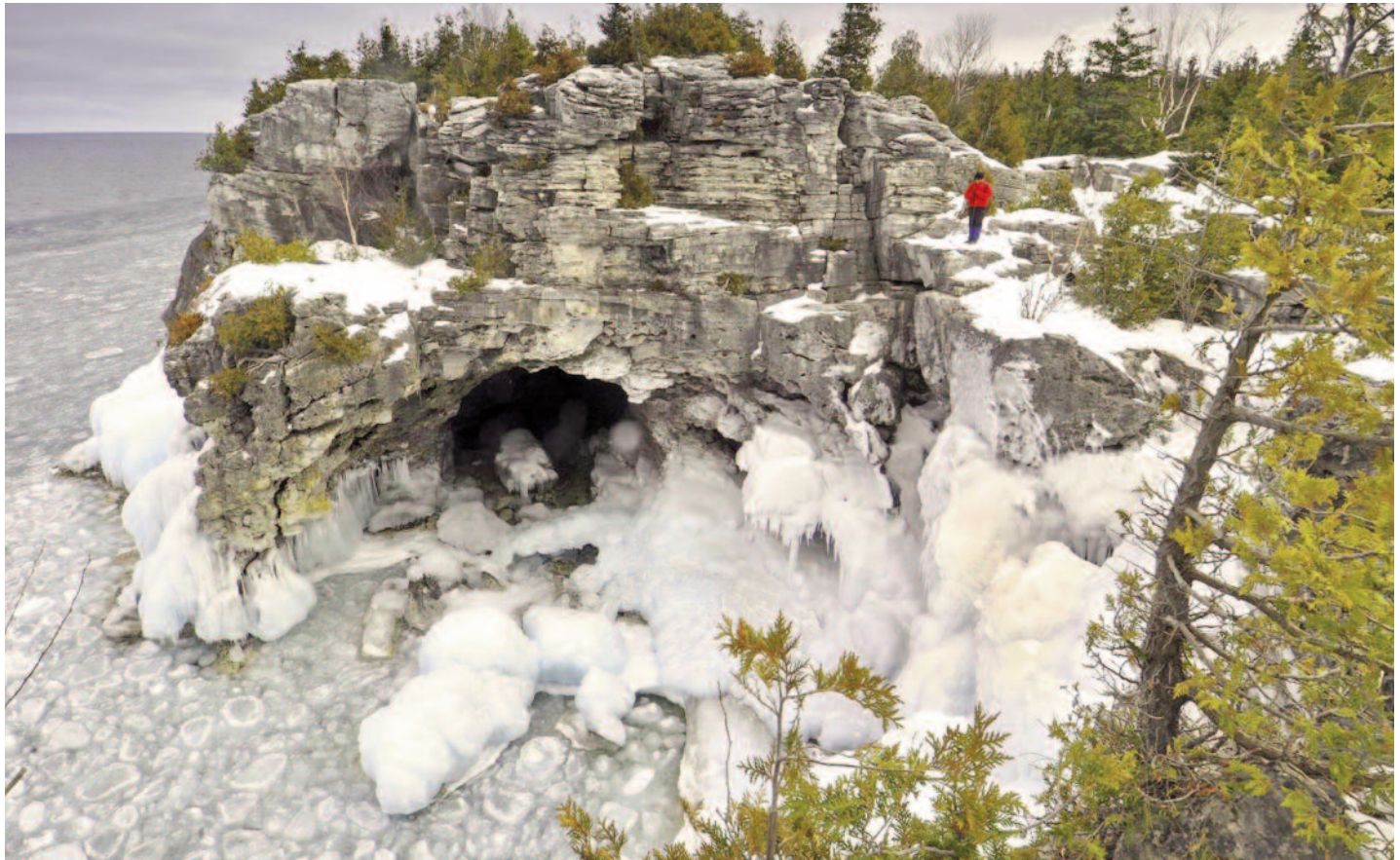
Ice and rock dwarf a lone hiker at the Grotto, Bruce Peninsula National Park in mid-February.