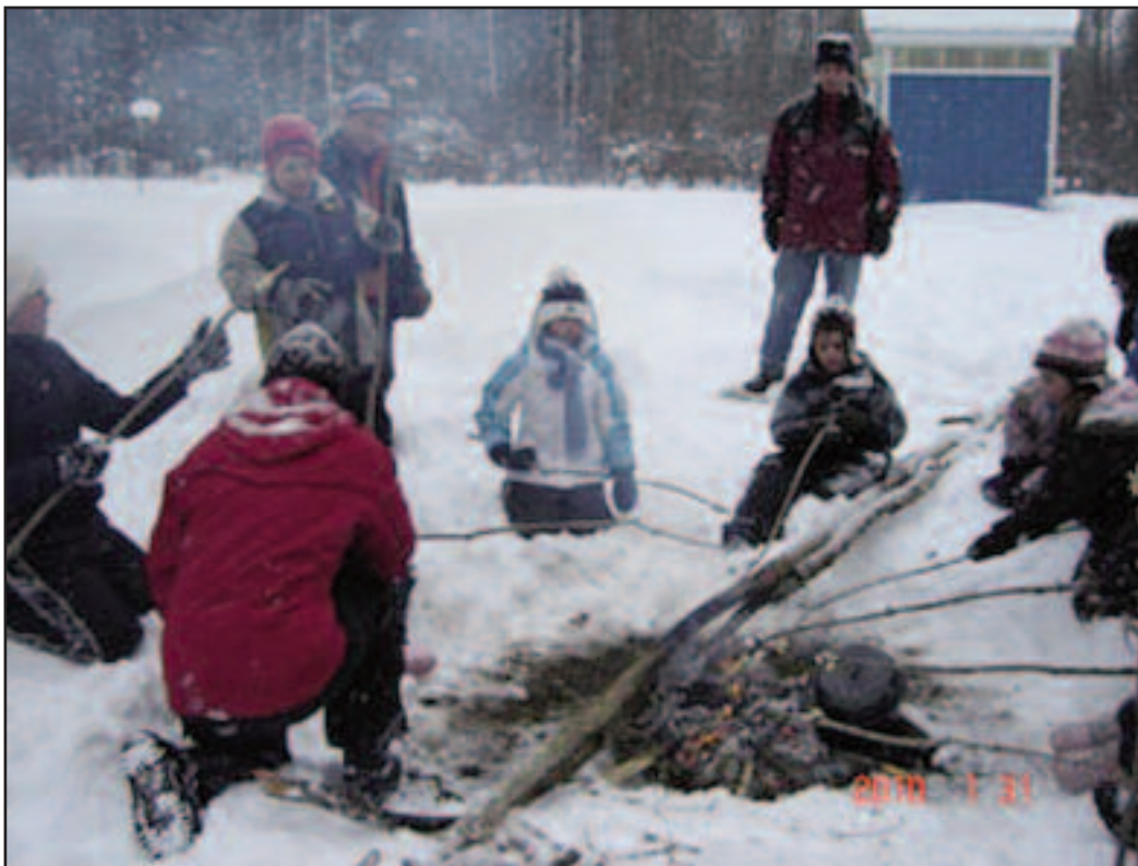
The Young Nats snowshoed at the Bognor Marsh Management Area on January 31st. The adults started a fire so that the Young Nats were able to cook bannock and have hot chocolate!

Bird Studies Canada has recently released a new tool within eBird Canada that shows locations of all recent sightings of interest across Canada. To get the tool, go to http://ebird.ca/sightings . jSP.