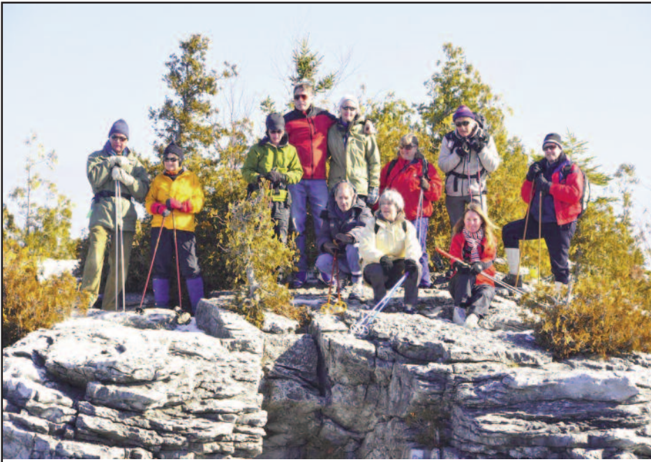
OSFN members enjoy brilliant sunshine after a mostly gloomy February at the outing to the Bruce Peninsula National Park.

A couple of ice fishermen had augured holes in the ice, which was about 16” thick. They were fishing for pickerel and perch.